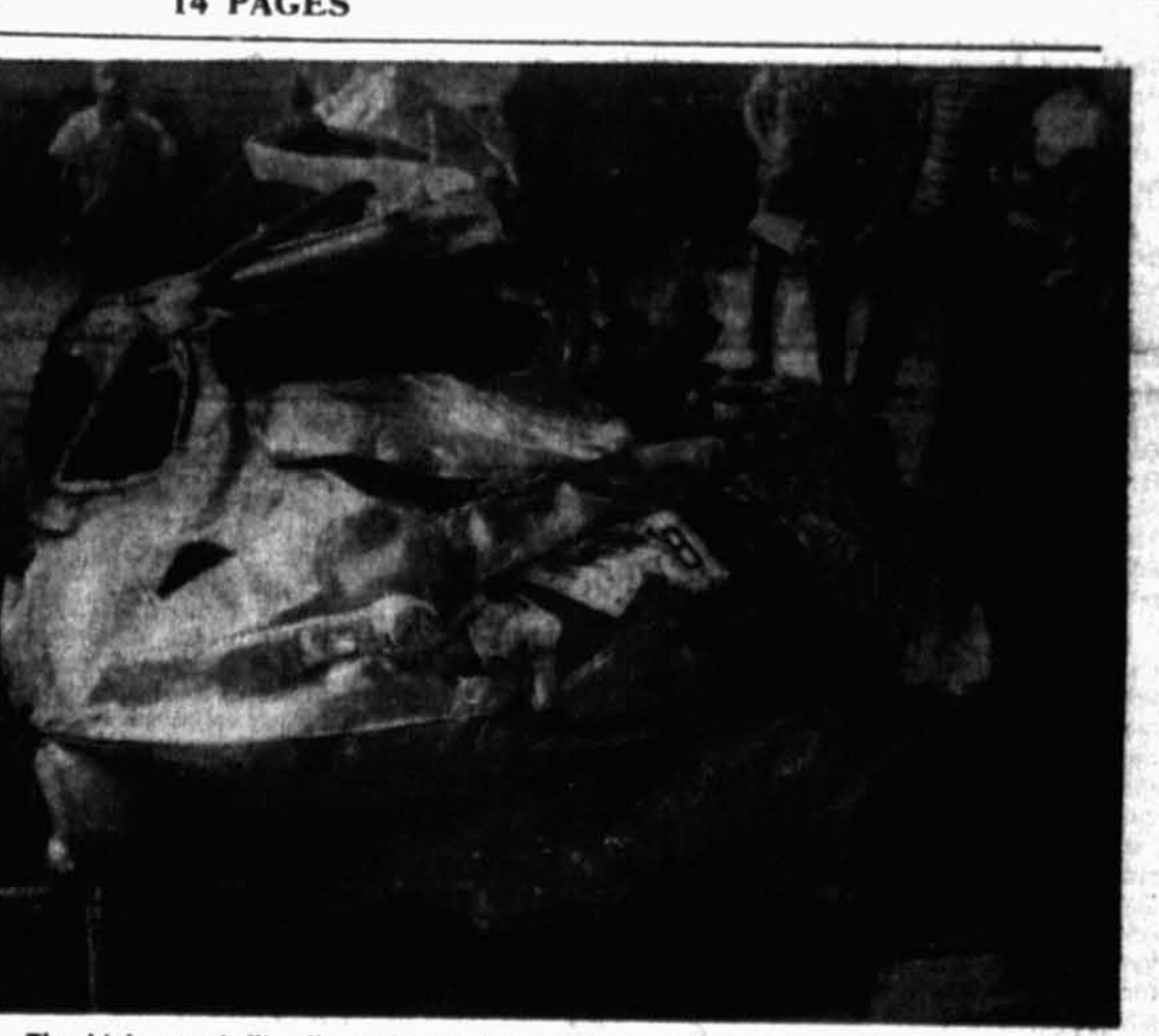
The high speed flip flops that killed three converted this sports car into a mass of scrap iron.

Howick has a connection with the moon mission. The son of a man born midway between Howick and Ste. Martine, is an instrumentation engineer on the Apollo shots.